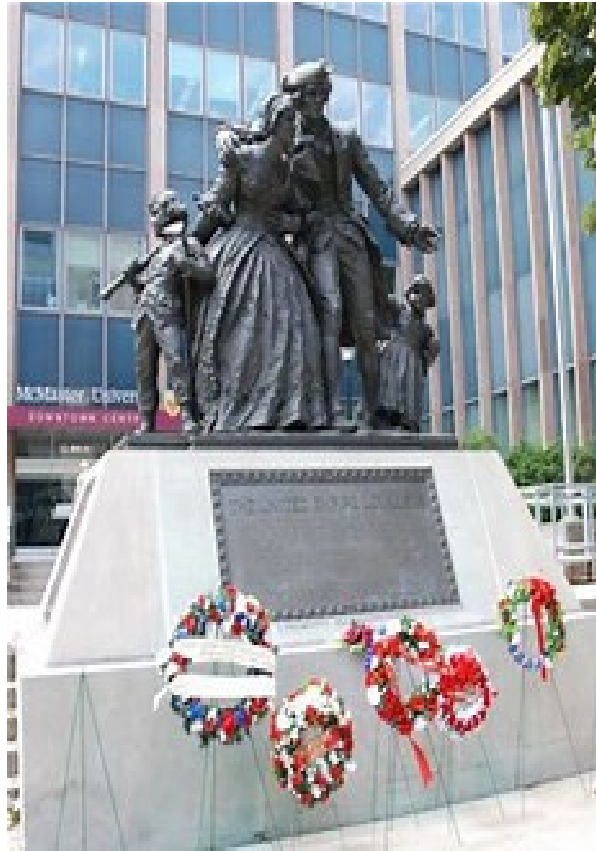
UEL MEMORIAL, HAMILTON, ON The Loyalist Flag